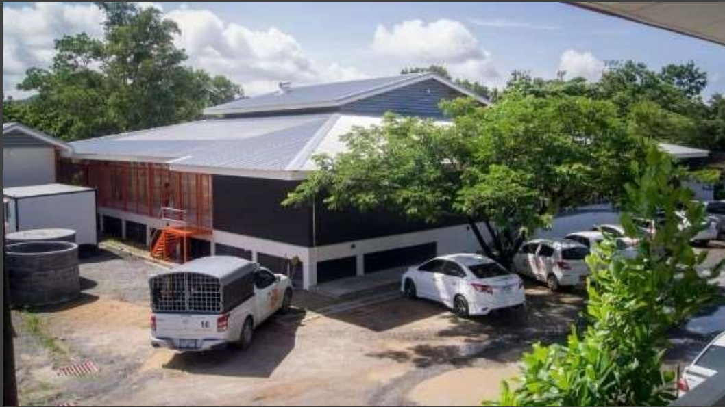
The dog hospital now fully operational at the Soi Dog shelter